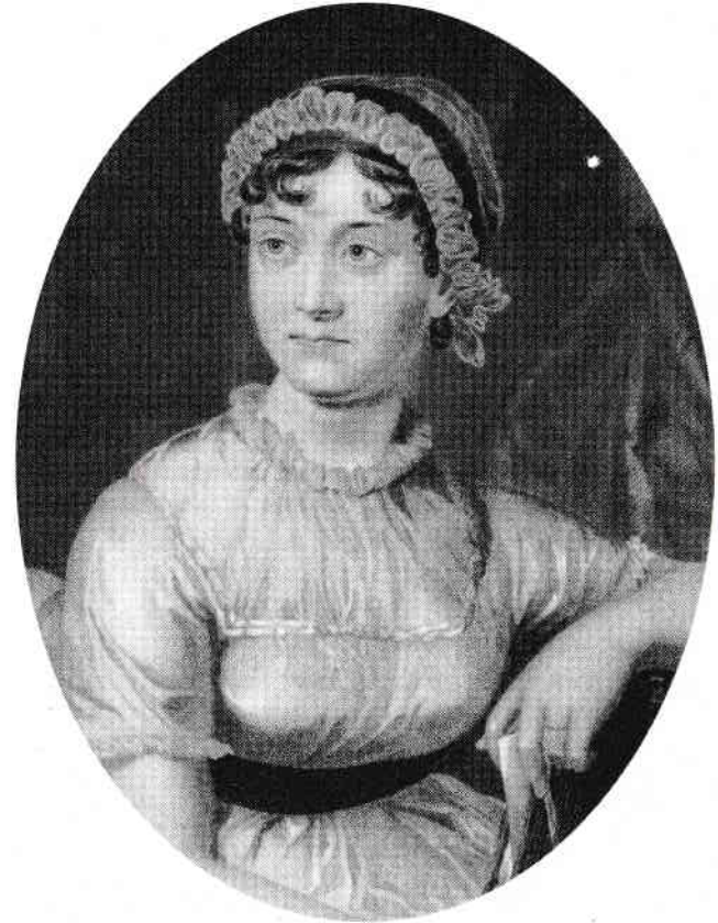
Jane Austen (1775–1817)